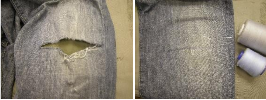
Before, Large hole in knee area Fused from inside the jean, thread colours compared