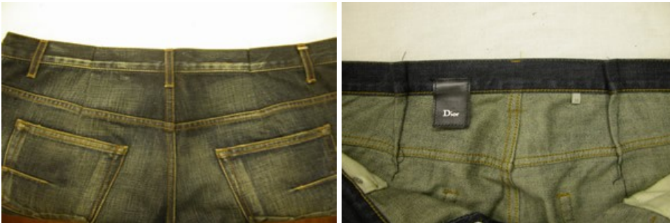
Before with two darts in waist line