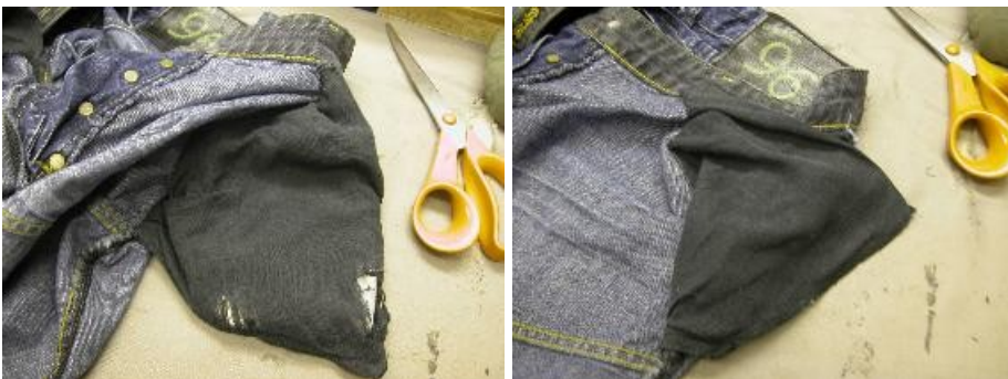
Cotton pocketing has worn away Trimmed away worn pocketing and stitched with over locked edge, for a more robust finish