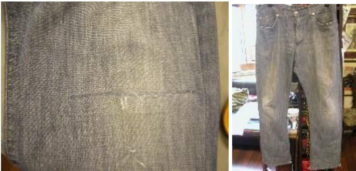
After, Repair work finished From a short distance, barely noticeable