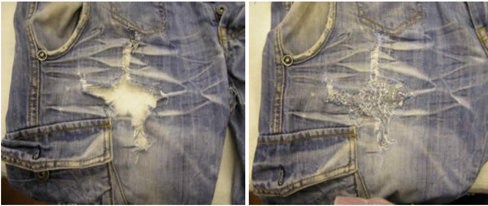
Before: large hole to thigh area.....After: fully repaired using designer paisley shirt material

This is an original Wrangler denim jacket from 1969, the gentleman who brought it to me has had this since new and was his most favourite item of clothing he owns. Being 41 years old ! and worn every year and pretty much every day of its life, its had the following issues, collar had serious wear, also the front edges and upper shoulders along with the bottom front parts. Below is the before and after pictures. He was amazed by the results, it was a joy to work on this jacket for him.